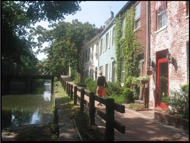
Canal Walk in Georgetown

The conference hotel is located at the border of Georgetown which offers hip restaurants and boutiques as well as the premier waterfront area of the District, National Harbor. A metro stop is only a five minute walk from the hotel so place is difficult to access.