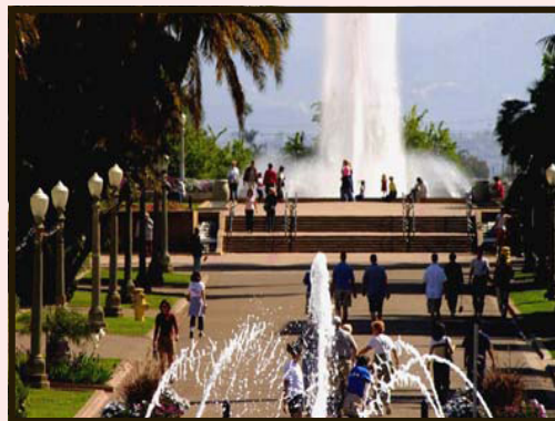
Fountains at Balboa Park