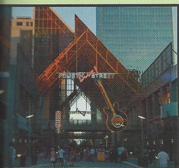
Louisville Live-Nightly free

July 22 nd is a free day. Take a steamboat down the Ohio River, follow the Bourbon Trail, visit Churchill Downs, explore these museums (among many others): the Louisville Slugger, Muhammed Ali, Arts & Craft, Speed Art, and Frazier International History.