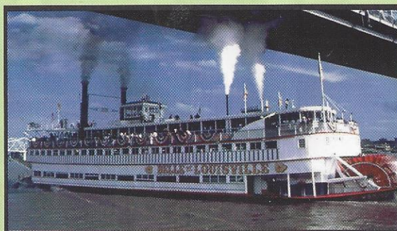
Belle of Louisville