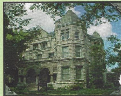
Conrad's Castle Site of Annual Dinner