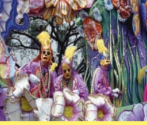
three centuries ago.

In this little corner of the American South, European traditions blend with Caribbean influences; the history is as colorful as the local architecture; the food is the stuff of legend. Haitian and African Creoles developed an Laissez les bons temps rouler— let the good exotic, spicy cuisine and were instrumental in creating jazz and Zydeco. times roll— is more than a reminder of its New Orleans had café au lait 250 years before Seattle steamed its first French heritage; it's a way of life that began latté or Starbucks roasted its first bean. Street names are French and Spanish, Creole architecture comes in a carnival of tropical colors, and voodoo is a Caribbean import. The magic is irresistible.